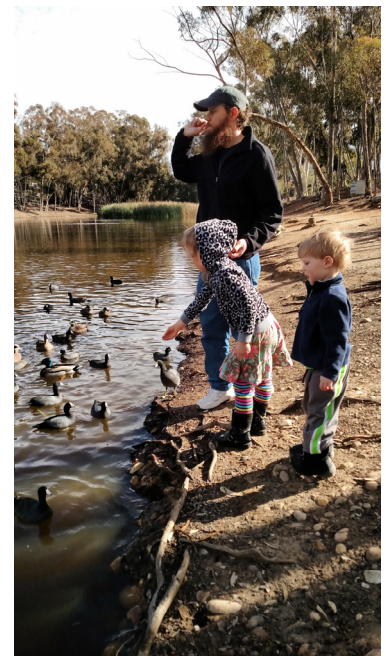
Kids and parents love feeding the Evan's Pond ducks with special floating duck food from Grace's Book Nook!