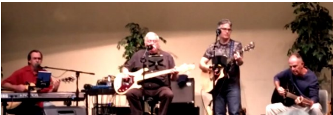
Scripps Ranch Rock-N-Blues Band will perform at both the "Evening to Remember" event and the Birthday Celebration.

Library Events: Please go to srfol.org or call 858-538-8158 for the list of activities