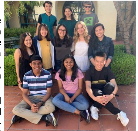
The new Teen Council

Our next big event is our annual Haunted Library on October 25. Hosted after hours from 7-9 pm, this is one of our favorite events. The Haunted Library is a night where we transform the library into a haunted house! Visitors are treated to a spooky night filled with laughter and screams that puts everyone in a festive mood for Halloween. With almost 200 participants last year, we are excited to see where this new year will take us.